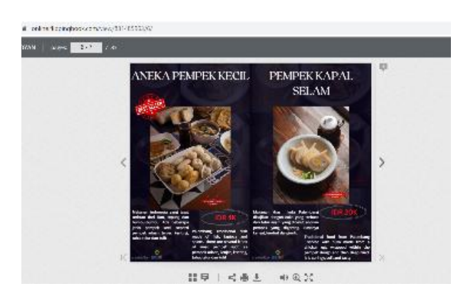
Figure 5 Revised Layout Display

The design analysis yielded an average score of 88.63, categorized as highly appropriate. The design expert suggested improvements in the layout and font combination. The draft was deemed usable following revisions.