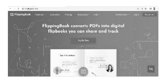
Figure 3 Export Process Used Flipping Book

The exported prototype became an online link that the public could access. When the link is activated, the promotional material appears as an e-flip book with a page-flipping effect, simulating the experience of turning the pages of a real book.