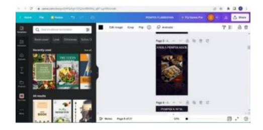
Figure 2 Product Developing used Canva

In this stage, the researchers developed the product and conducted expert evaluations. The product was designed using an online design tool, Canva, to transform the linguistically validated draft into a template. The colour scheme of red, black, and white was chosen to align with the Pempek Flamboyant logo.