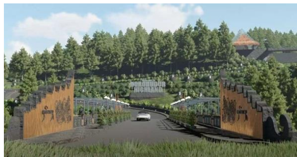
Figure 1. Front view of the Borobudur Highland area

The Borobudur area will have a new tourist spot, namely Borobudur Highland. The concept looks like a tourist area that blends with nature in the middle of a forest.