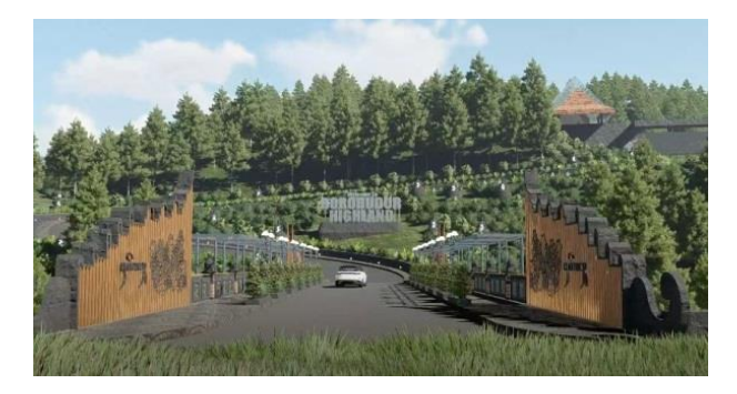
Figure 1. Front view of the Borobudur Highland area

The Borobudur area will have a new tourist spot, namely Borobudur Highland. The concept looks like a tourist area that blends with nature in the middle of a forest.